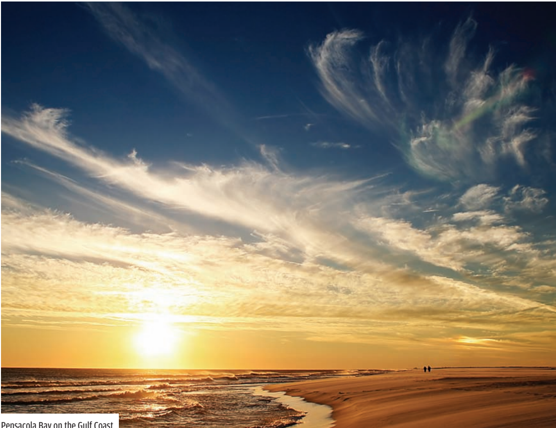
Pensacola Bay on the Gulf Coast