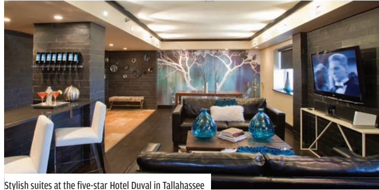
Stylish suites at the five-star Hotel Duval in Tallahassee

Pensacola was actually founded earlier than St Augustine, in 1559, but growth was thwarted by wars