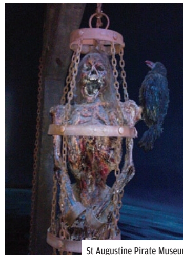
St Augustine Pirate Museum