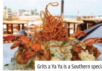
Grits a Ya Ya is a Southern special

I also visit the St Augustine Pirate Museum, a treasure chest of blood-curdling stories and interactive exhibits, such as an original Jolly Roger flag and one of the world's