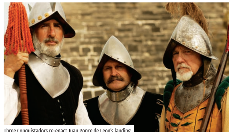
Three Conquistadors re-enact Juan Ponce de Leon's landing

romantic pubs. During the holiday season (November 17 to January 31) the city twinkles with thousands of white lights, which makes my night time tram tour a starry-eyed experience. One of St Augustine's most notable buildings is Flagler College, a luxury hotel from the late 19th century and now a private educational institution. It's open for tours so I pop into the grand-looking dining room, where the students are tucking into brunch. The main college door never closes - a tribute to founder Henry Flagler Turn to 38