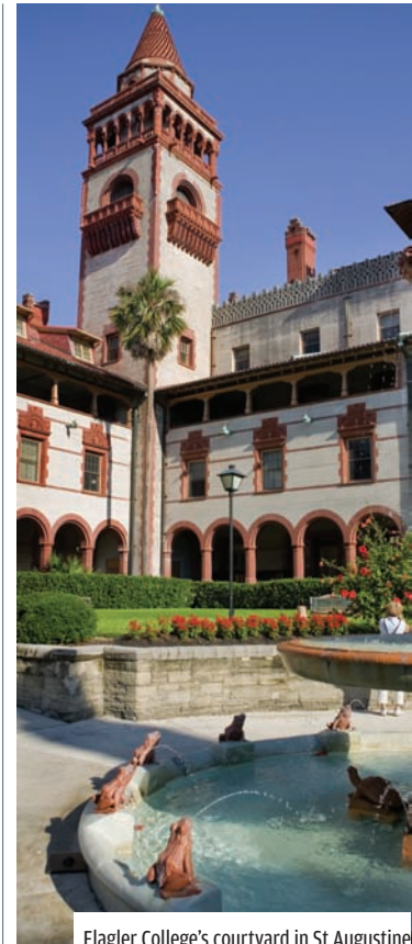
Flagler College's courtyard in St Augustine